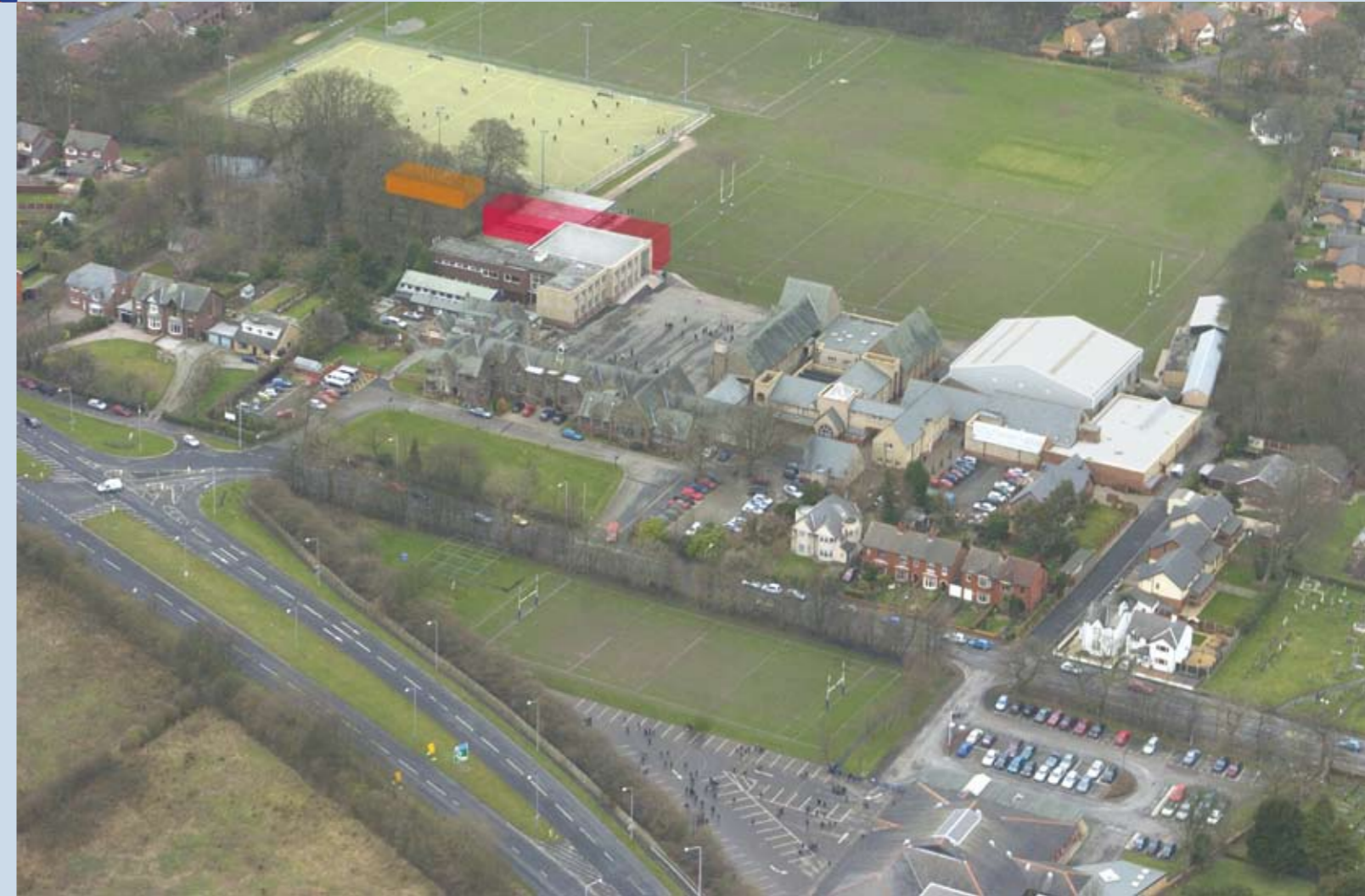
Phase II and III of the Development in red The Lawrence House Pavilion in orange

Excitingly this also represents our first venture in a Community Programme that sees the school developing its facilities in liaison with Community users to mutual benefit. We hope this partnership will flourish and benefit us all.