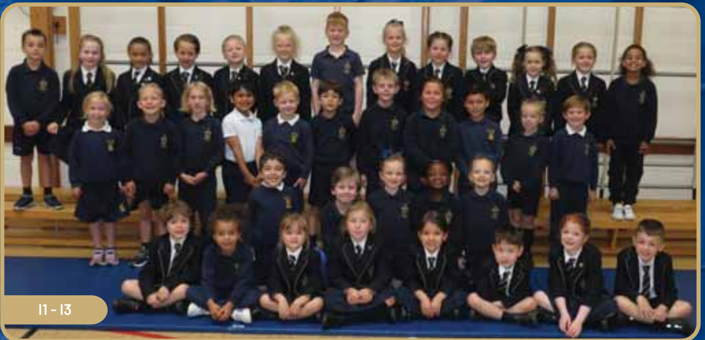
11 - 13