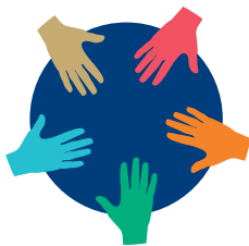
Equality & Inclusivity Committee

This year, we focused on the two main aspects of health and wellbeing: physical and mental. Dedicated to delivering important messages and advice to students, we set out a series of in form Powerpoints that each received over 200 responses. Listening and acting on the feedback given, we have increased awareness and accessibility to online and in-person support systems, such as the school's partnership with KOOTH and our own newly-established pastoral hub. We have also provided useful information on issues such as the damages of vaping, peer pressure and social media and where to go for help. Finally, encouraging student physical health, we are working with the sport department to widen the variety of sports available so it is inclusive and equal for all pupils of any age and gender. We hope to continue refining and improving health and wellbeing at KGS, with the continued support and contribution of both the pupils and staff.