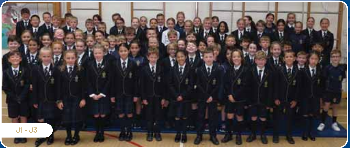
J1 - J3