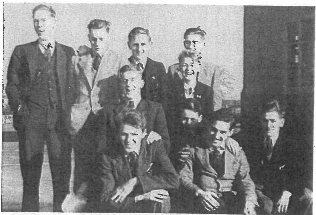
(Below) The Sixth Form Carol Party, 1948