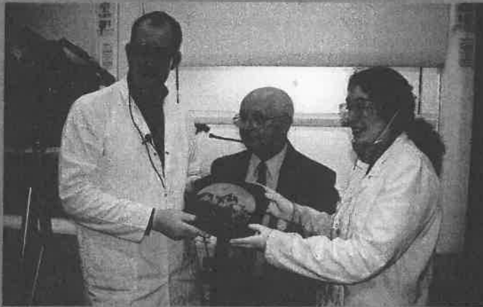
Top picture: KGS pupils watching the opening of the 1937 time capsule