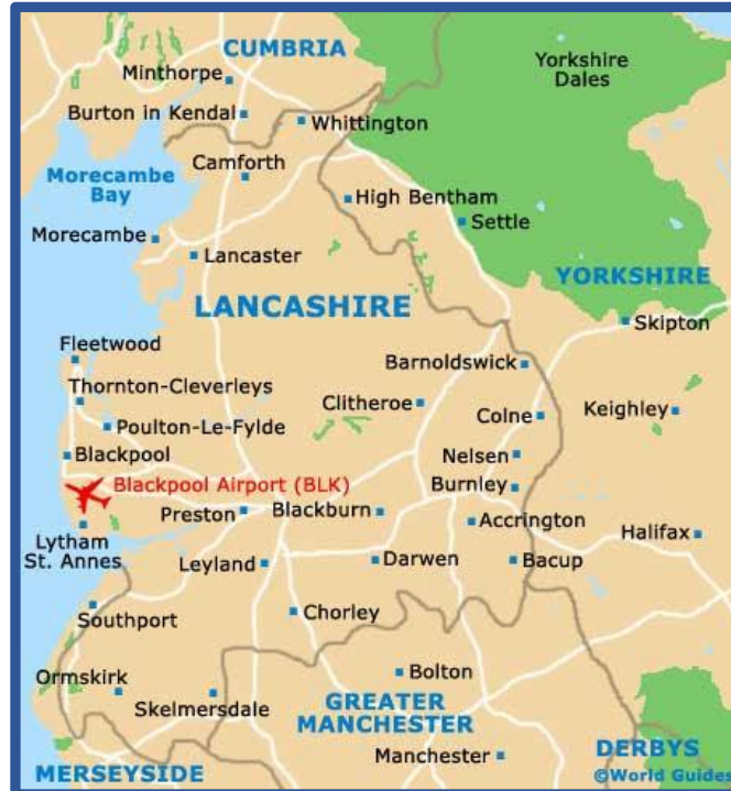
A map to show counties which border Lancashire