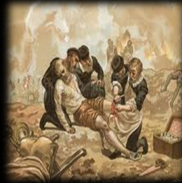
Surgery on the battlefield