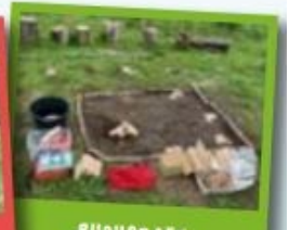
BUSHCRAFT - MAKING A FIRE

Larkhill Primary School, Wilson Road, Larkhill, Salisbury SP4 8QB