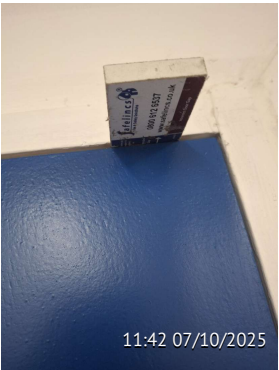
Issue 6 Gaps Adjusted