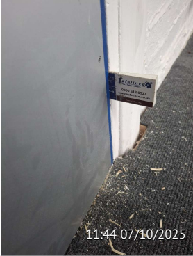
Issue 11 Gaps Adjusted