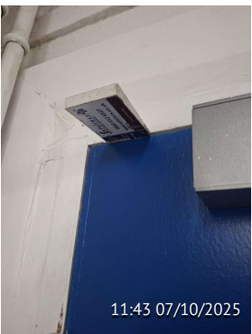
Issue 8 Gaps Adjusted