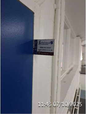
Issue 7 Gaps Adjusted