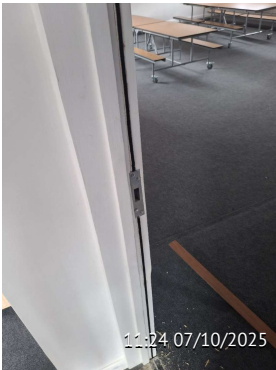
Issue 2 Replace Intumescent Strips