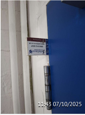
Issue 9 Gaps Adjusted