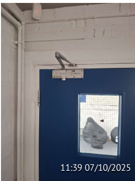
Issue 4 Adjust Door Closer ( Bouncing)