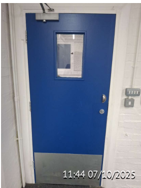
Issue 12 Door Complete