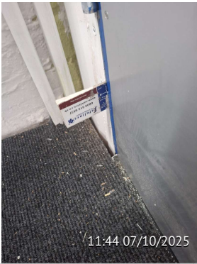
Issue 10 Gaps Adjusted