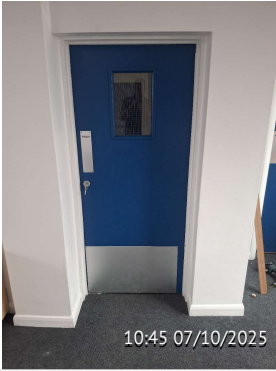
Issue 1 Adjust Gaps Around Door/Adjust Closer/Replace Strips