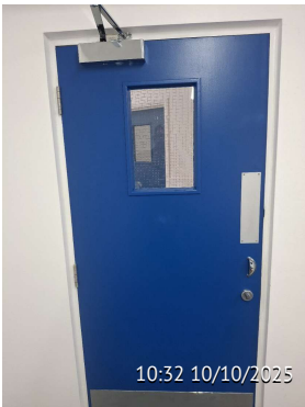
Issue 3 New Closer