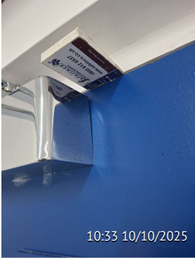
Issue 7 Gaps Ok