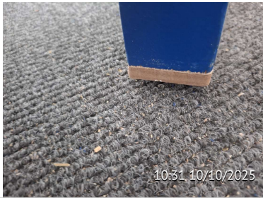
Issue 2 Install Lipping