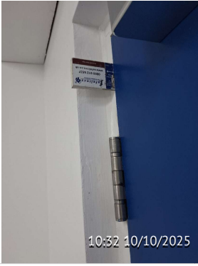
Issue 5 Gaps Ok