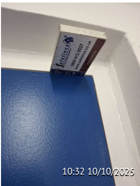
Issue 4 Gaps Ok