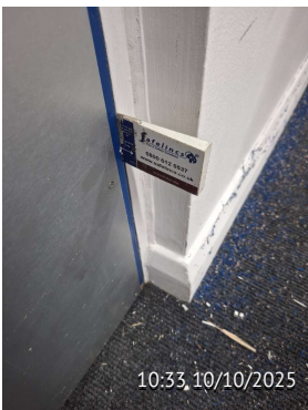
Issue 8 Gaps Ok