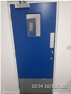
Issue 10 Complete