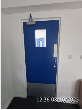
Issue 1 Ease And Adjust Gaps To Door/ Add New Intumescent Strips/Adjust Closer/