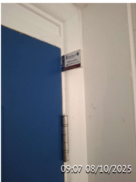
Issue 4 Gaps Ok