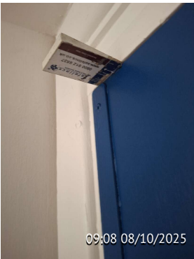
Issue 8 Gaps Ok