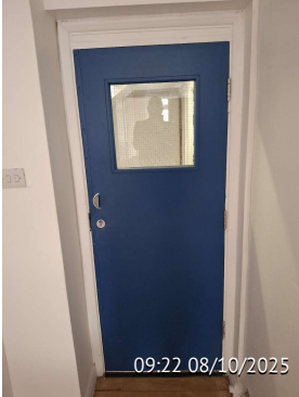
Issue 11 Door Complete