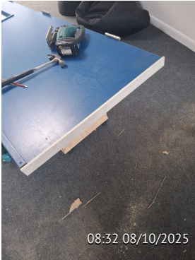
Issue 2 Relip Bottom Of Door