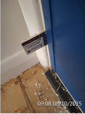
Issue 7 Gaps Ok