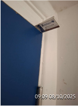
Issue 9 Gaps Ok