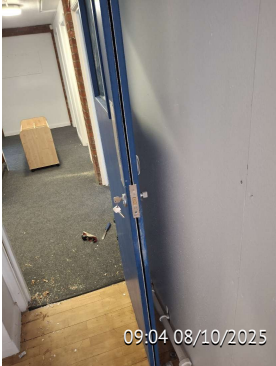
Issue 3 Replace Intumescent Strips