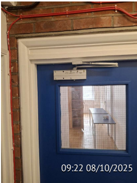
Issue 10 Adjust Closer