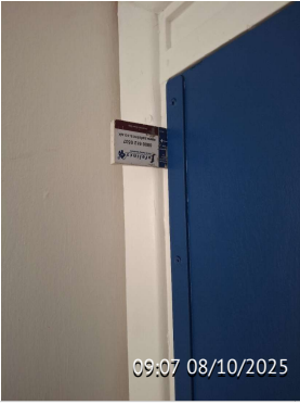
Issue 5 Gaps Ok