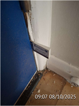
Issue 6 Gaps Ok