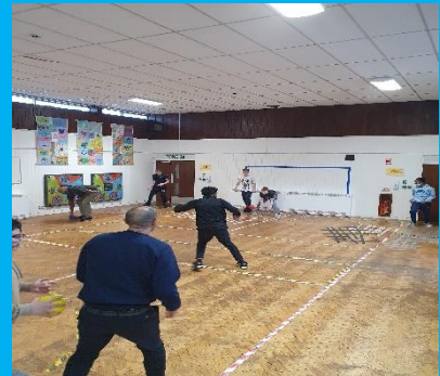
Some of our KS4 & OAK Students & Staff Playing Dodge Ball