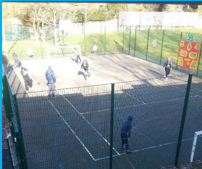
KS4 Students Accessing a Flag Football Session