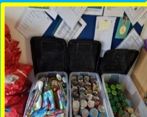
Some of the food items that our KS4 Team distributed to families