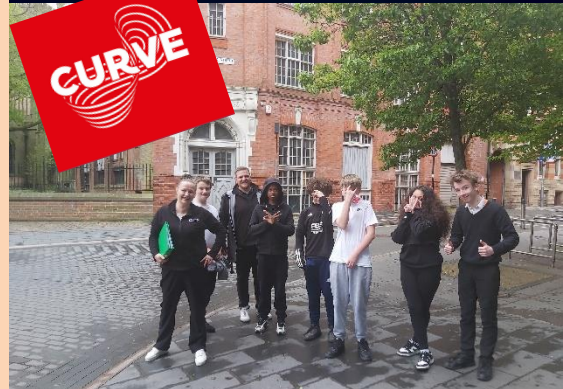
Some of our students after their visit to The Curve Theatre to see the musical – Blood Brothers

Some of our key Stage 3 Drama students visited the theatre to watch the musical 'Blood Brothers'.