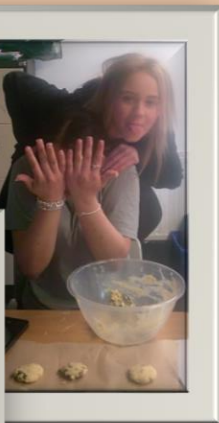
KS3 Students enjoying some maths fun