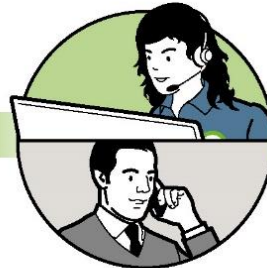
6 Category A incidents are reported immediately by telephone, and within a report that is emailed the same day