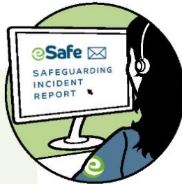
7 Category B incidents are reported that day by email Category C incidents are detailed in a weekly round-up report, by email