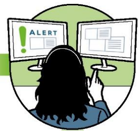
4 They determine if it's genuine or not