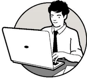
1 A User logs on