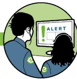
3 The incident is examined by a Behaviour Analyst