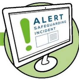
2 An alert is triggered