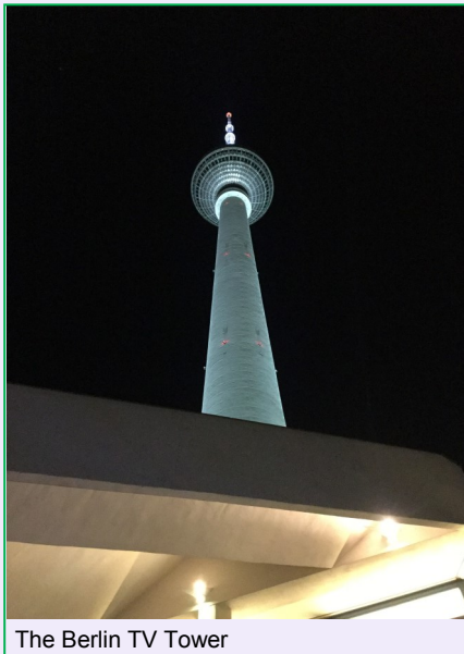
The Berlin TV Tower

Year 11 students visited Berlin during the half term break, and were lucky enough to enjoy sunny days to take in the historical sights and consolidate their learning of Nazi Germany and the Cold War. The visit was packed with activities such as a walking tour, The Palace of Tears Museum, the DDR Museum, Checkpoint Charlie and an evening trip to the TV Tower to take in breathtaking views of the city