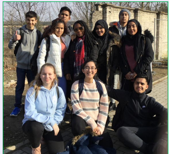
Sachsenhausen concentration camp