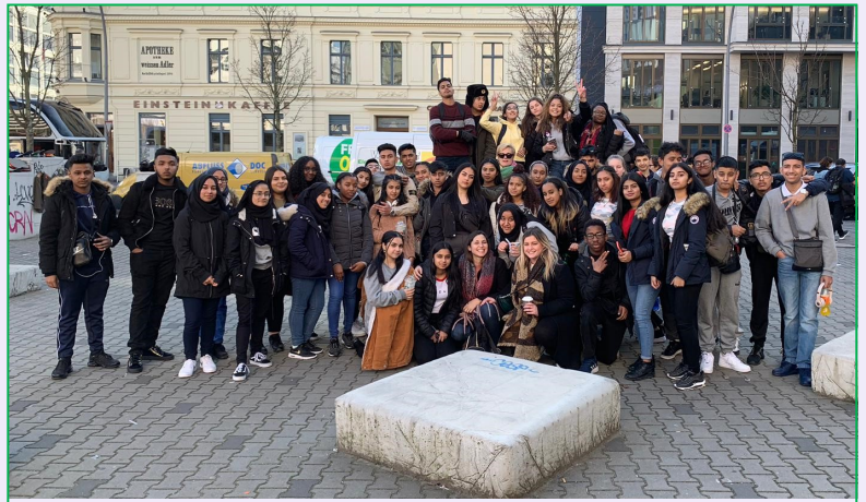
Taking a break on the walking tour