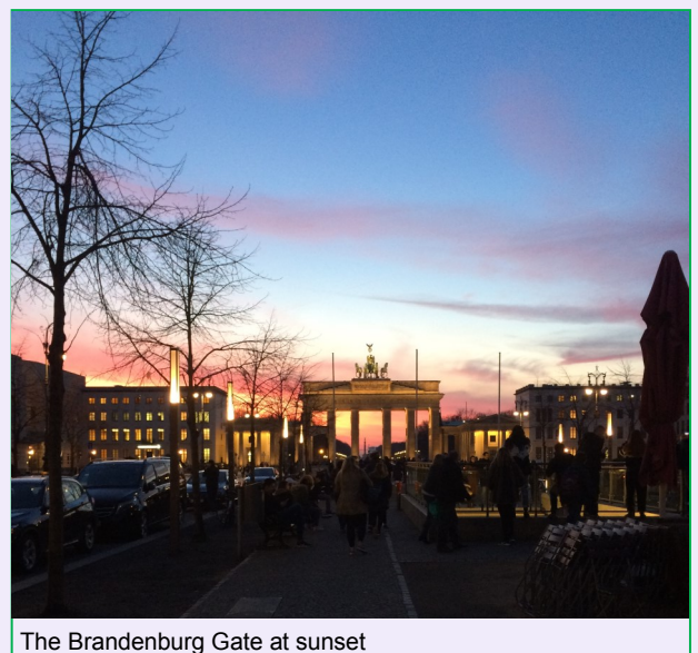
The Brandenburg Gate at sunset