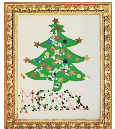
Fahamedha, Year 7 Blue Class