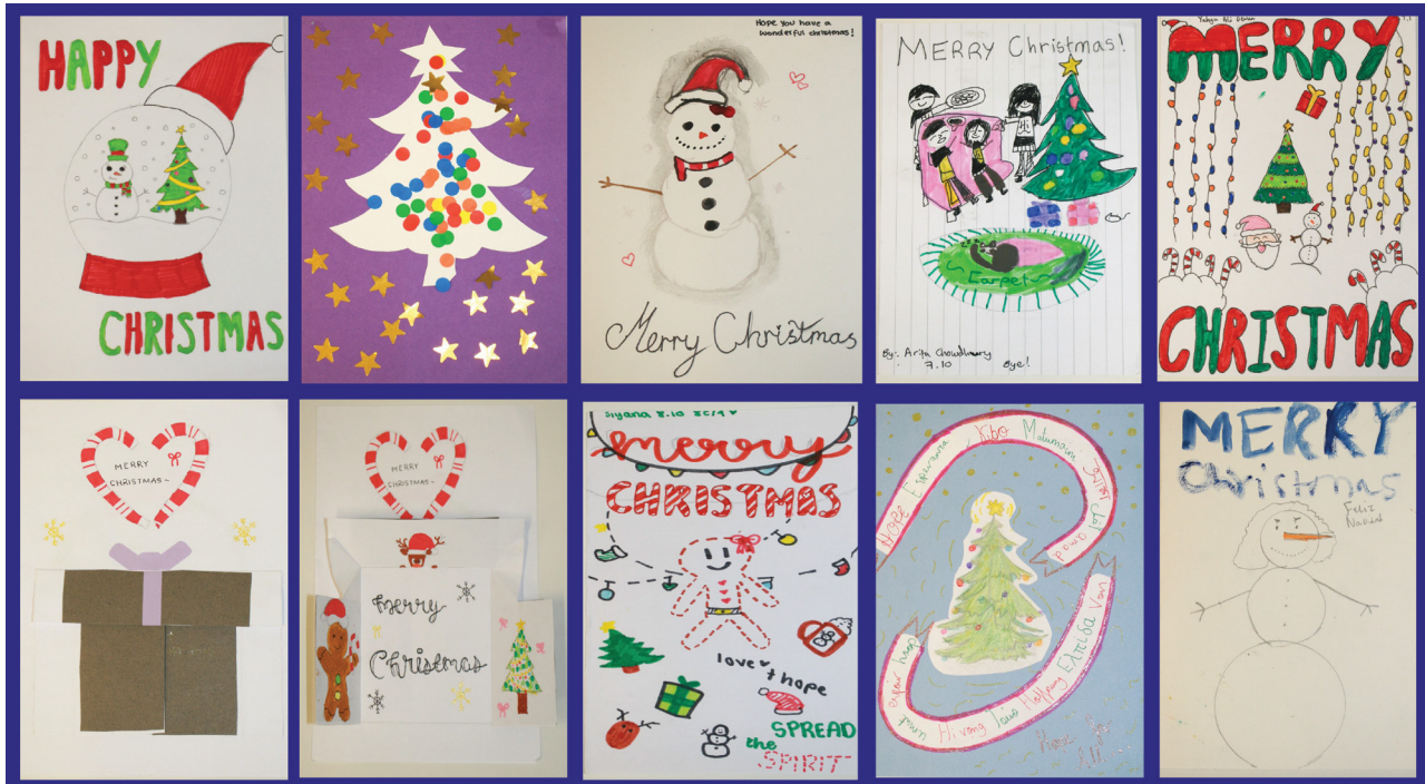
1st Place Winner

Every year, we hold a Christmas Card Competition to get the holiday spirit going!