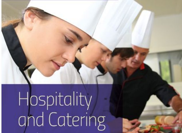
Hospitality and Catering