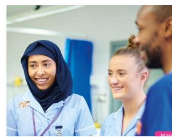
Health and Social Care