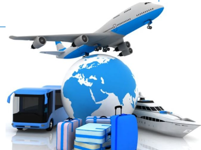
Travel and Tourism

There are different subjects offered for vocational qualification. Level 2 :Equivalent of GCSE grades 9 to 4.