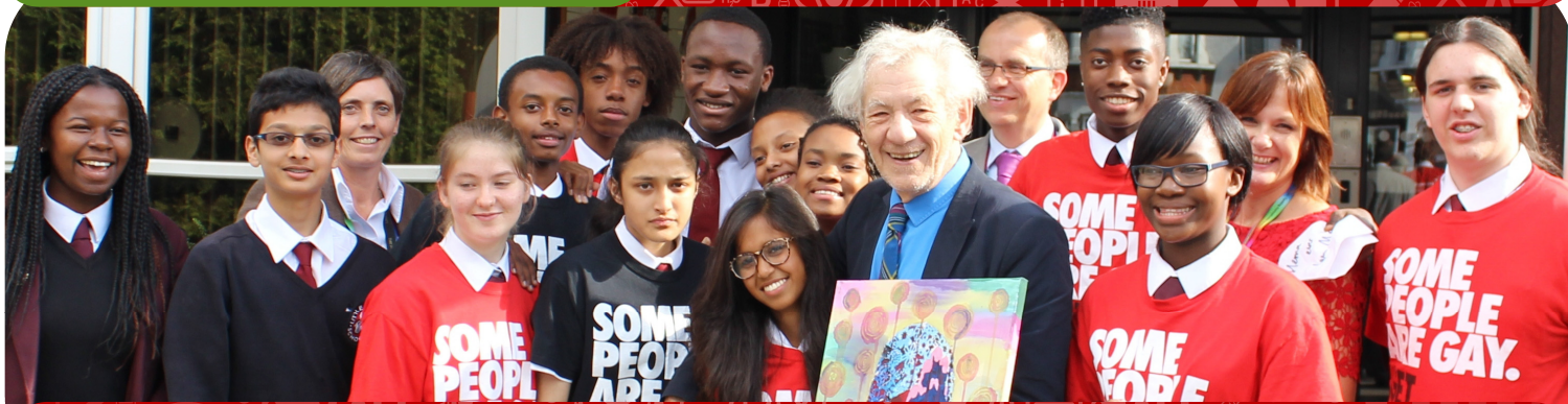
Students and Staff meet Sir Ian McKellen. Full story on page 3

Learning Together Achieving Together Succeeding Together