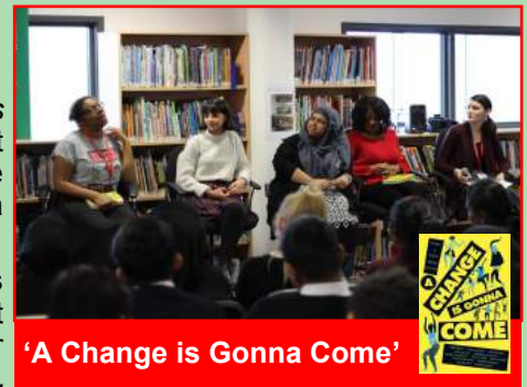
'A Change is Gonna Come'