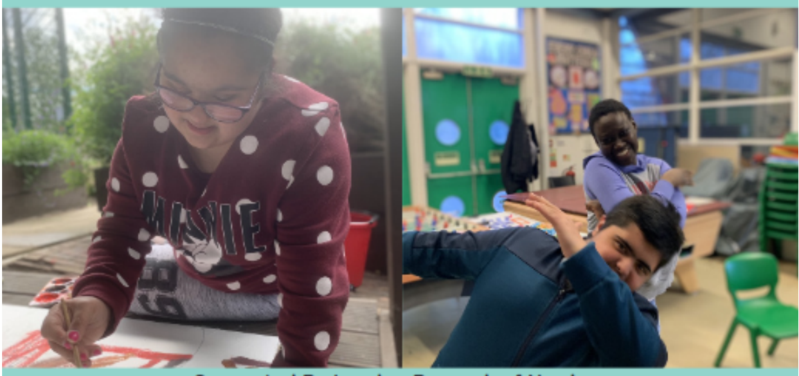
Supported By London Borough of Newham

Activities Include: A Variety Of Sports, Arts And Crafts, Movies, Music, Keep Fit Sessions, Table Tennis, Games And MUCH MUCH MORE!