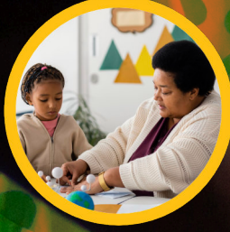
CHILD CARE ASSISTANT