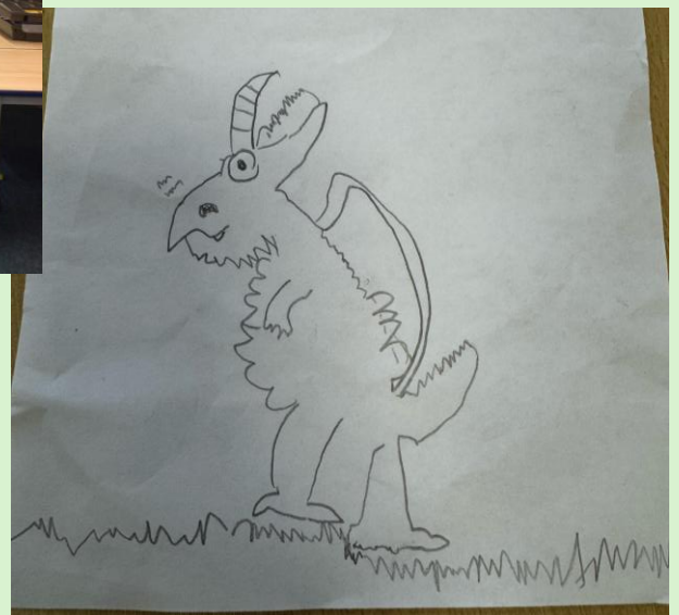
An illustration drawn by Ivar in Reception