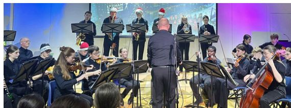
Lytham's Got Talent