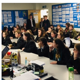
(Event was before Covid-19)

To ensure our pupils get the best experience possible during their time at LSA, every year all pupils must participate in at least one activity or event in each of the 6 areas and document it in their More Than Grades Logbook. Every Friday we publish our pupil bulletin, filled with the latest information, including school clubs and events. View the latest bulletin here: