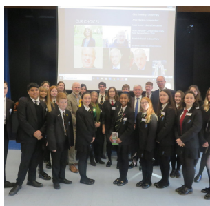
(Event was before Covid-19)