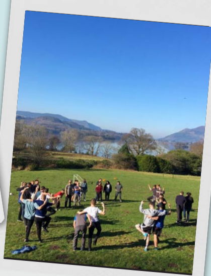
GET TO KNOW YOUR CLASS MATES