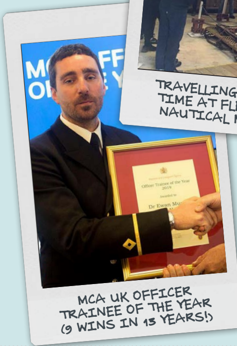
MCA UK OFFICER TRAINEE OF THE YEAR (9 WINS IN 13 YEARS!)