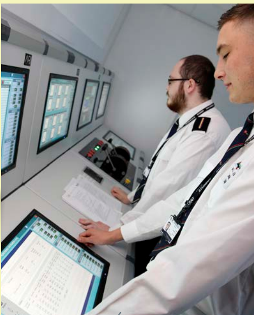
SIMULATED REALITY EXPERIENCE