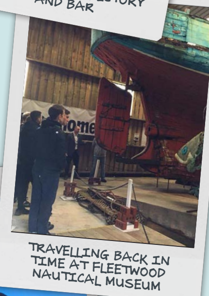
TRAVELLING BACK IN TIME AT FLEETWOOD NAUTICAL MUSEUM