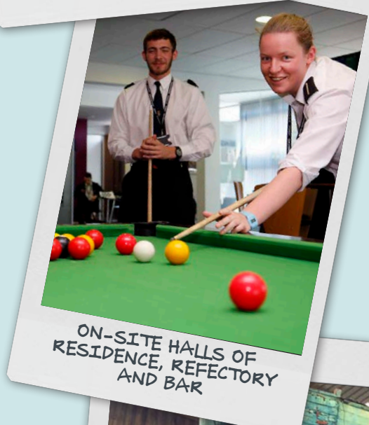
ON-SITE HALLS OF RESIDENCE, REFECTORY AND BAR

PROFESSIONAL ADVICE TO HELP YOU PLAN YOUR FUTURE