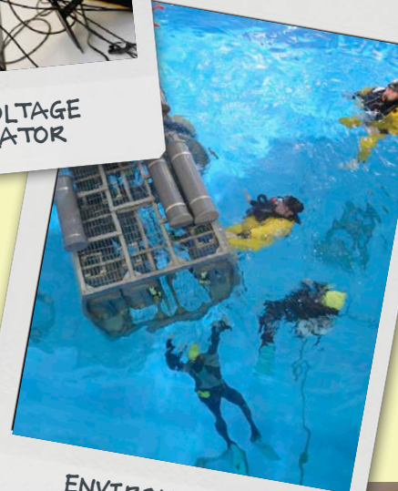
ENVIRONMENTAL TRAINING TANK