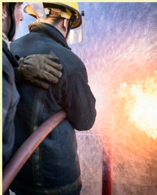
FIRE-FIGHTING TRAINING FACILITY