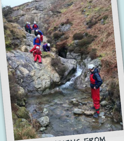
EVERYTHING FROM ROCK-CLIMBING TO CANOEING