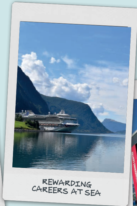
REWARDING CAREERS AT SEA