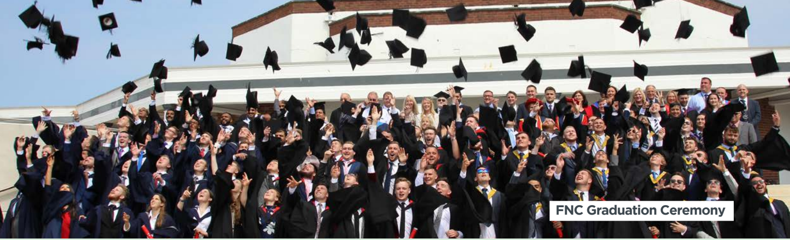
FNC Graduation Ceremony