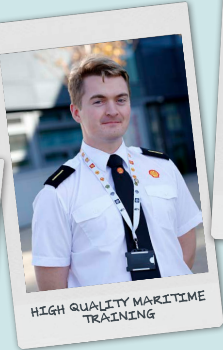
HIGH QUALITY MARITIME TRAINING