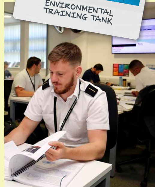
CUTTING EDGE LEARNING RESOURCE CENTRE

“These new facilities are bringing what is already an excellent training establishment ahead of other establishments.”