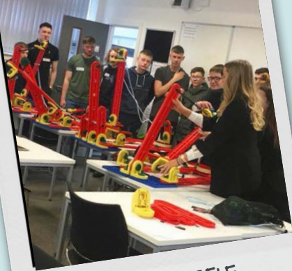
PUT YOURSELF TO THE TEST