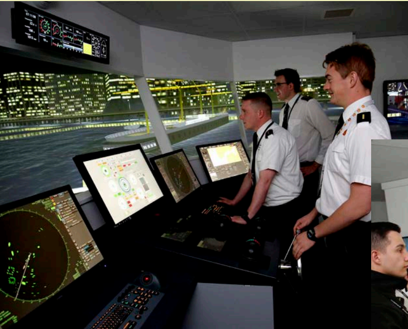
FULL MISSION SHIP BRIDGE SIMULATORS

CONSTANT INVESTMENT IN OUR FACILITIES MEANS THE LATEST TECHNOLOGY AND RESOURCES AT OUR AMAZING PURPOSE-BUILT CAMPUS.