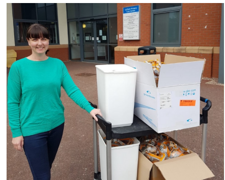
LSA D&T Dept @LSATechdept · 11h First of many face shields being printed @lythamhigh. #SupportTheNHS. @3dcrowduk @LSAFood

Please keep checking our social media streams, as well as our school website for regular information and updates.