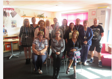
Photo: Our SEN Team

LSA is a wonderful school. The staff are dedicated to enriching the lives of all the students, not only through the curriculum but also through values shown for each individual. The extra-curricular activities are extensive and varied, giving each child plenty of choices for developing their interests.