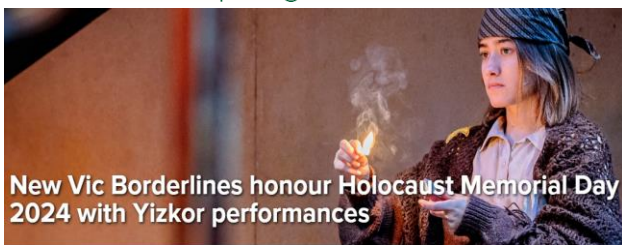
New Vic Borderlines honour Holocaust Memorial Day 2024 with Yizkor performances