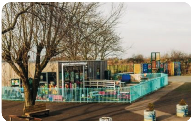
The separate Reception classroom - The Richard Scott Qube

The Reception classroom building also provides an administration office and is supplemented by a garden shed for pupils with special needs.