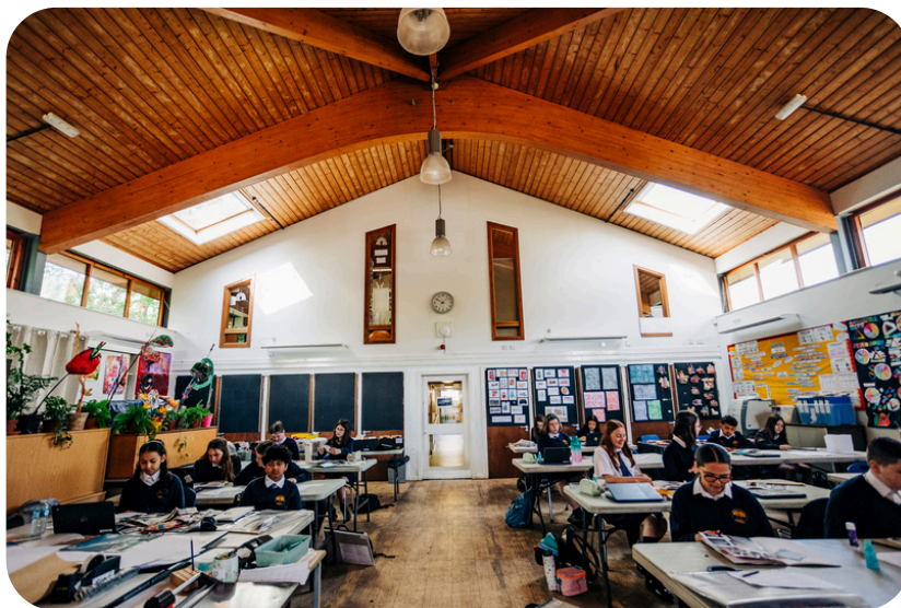
Maharishi School Secondary phase – Room 1, our multi purpose room

The school is applying to the Department for Education (DfE) for permission to acquire the relevant land and develop the new, purpose-built facility for the whole school. We are also commissioning RICS valuations of both of the school's current sites and are in the process of obtaining professional plans and costings from specialist educational building consultants for the new development, on a no-win no-fee basis.