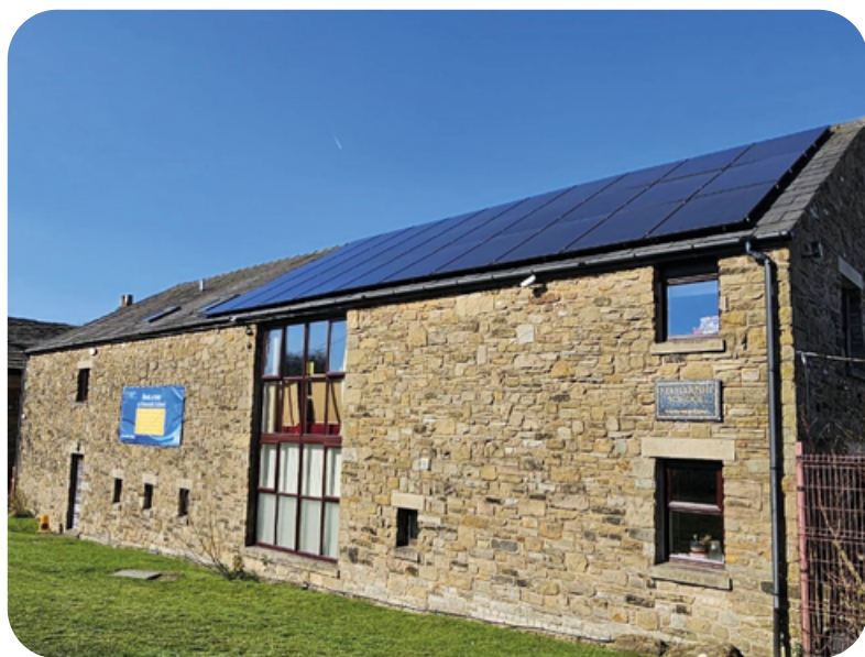
Maharishi Primary School - The Davies Building

Maharishi School's primary phase currently occupies a converted barn and a purpose-built, timber-framed building housing the Reception class, in a semi-rural location in Lathom, just outside Skelmersdale, Lancashire. At one time the barn housed both the primary and secondary phases, supplemented by two temporary buildings.