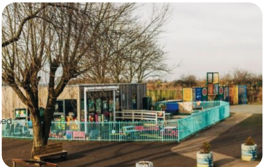
The separate Reception classroom - The Richard Scott Qube

The Reception classroom building also provides an administration office and is supplemented by a garden shed for pupils with special needs.