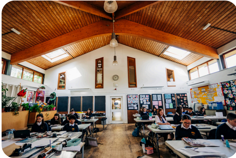
Maharishi School Secondary phase – Room 1, our multi purpose room

The school is applying to the Department for Education (DfE) for permission to acquire the relevant land and develop the new, purpose-built facility for the whole school. We are also commissioning RICS valuations of both of the school's current sites and are in the process of obtaining professional plans and costings from specialist educational building consultants for the new development, on a no-win no-fee basis.