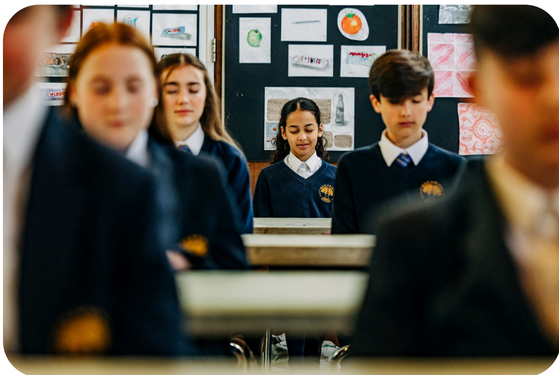
Secondary pupils participating in their twice daily meditation

We therefore wish to raise funds to develop purpose-built premises, with the primary and secondary phases back together on one site, with improved science lab and art facilities and other required dedicated spaces, and our own sport provision. In this our 40th anniversary year, we feel it is time for Maharishi School pupils to be offered all the school facilities that other children take for granted.