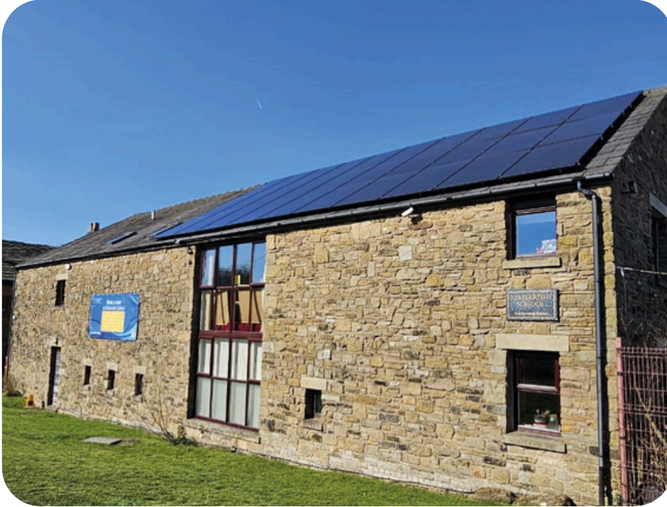
Maharishi Primary School - The Davies Building

Maharishi School's primary phase currently occupies a converted barn and a purpose-built, timber-framed building housing the Reception class, in a semi-rural location in Lathom, just outside Skelmersdale, Lancashire. At one time the barn housed both the primary and secondary phases, supplemented by two temporary buildings.