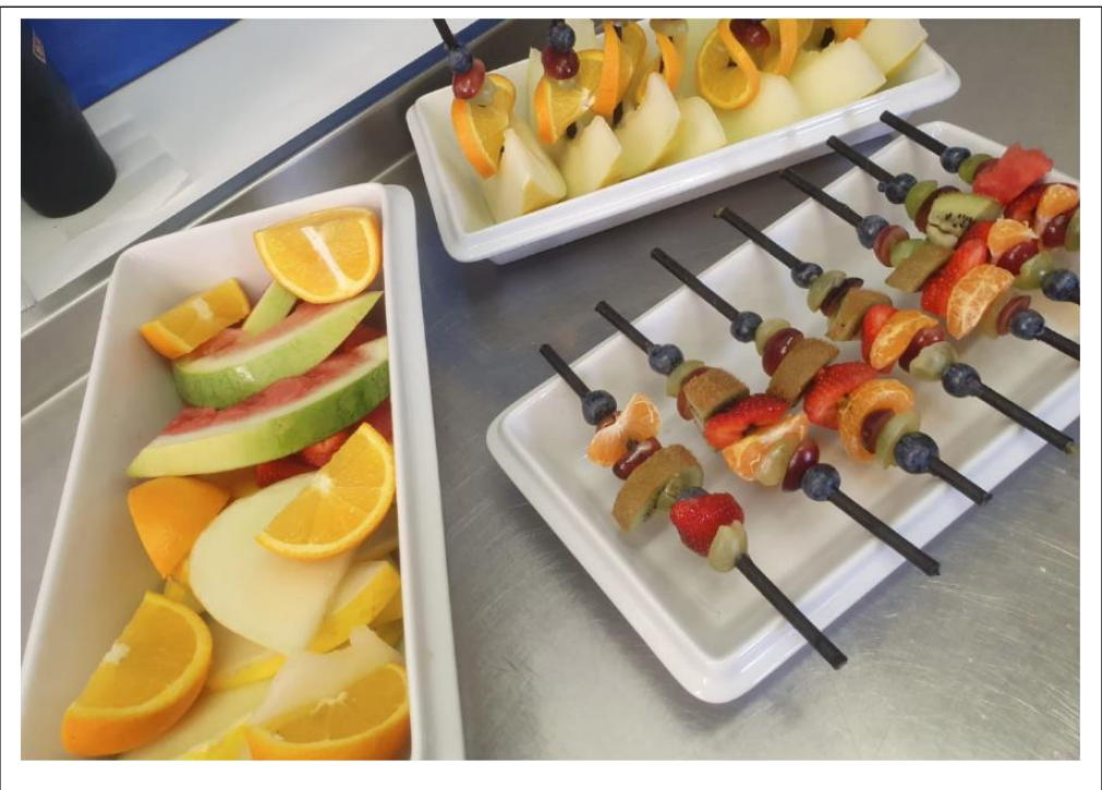
The kitchen have shared an image of some of the fruit served at dinner.