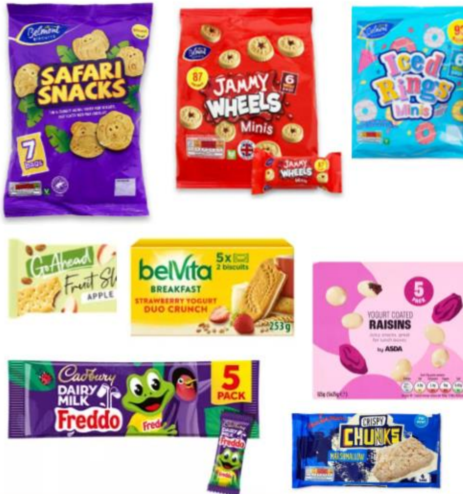
Products that state 'may contain nuts'