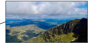
The Northern Highlands and the Grampian Mountains are the mountain ranges in Scotland.