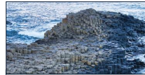
The Giant's Causeway is an amazing rock formation on the coastline.

The landscape of the UK is very varied. Physical features would be here even if there were no people around (e.g. seas, mountains, rivers).