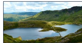
Snowdonia National Park, the Cambrian Mountains and the Brecon Beacons are the mountain ranges in Wales.