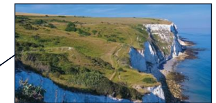
The cliffs on the coastline are famous here. They are called the White Cliffs of Dover .