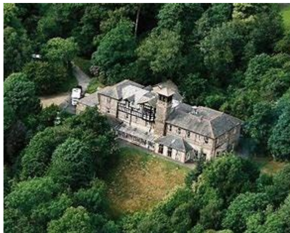
1 - Bassenfell

The balances for London and Manchester were due on 2nd March and the balance for Keppleway was due on 26th February. We kindly ask that those who have yet to pay do so by Wednesday 5th March at the latest. School has to pay for all the accommodation and activities up front from our budget so we appreciate all payments being made within the requested time frame. Thank you.