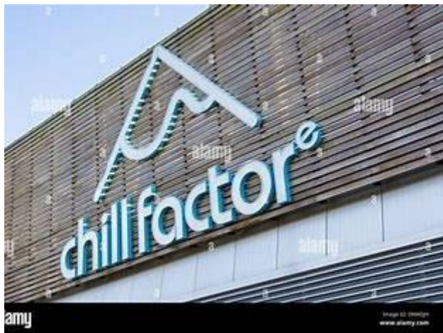
4 - Manchester