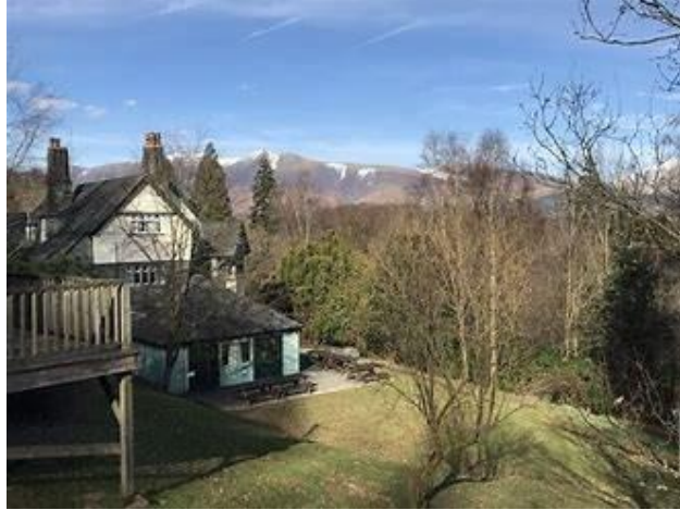
2 - Hawesend