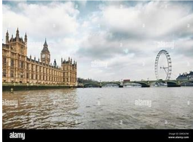
5 - London