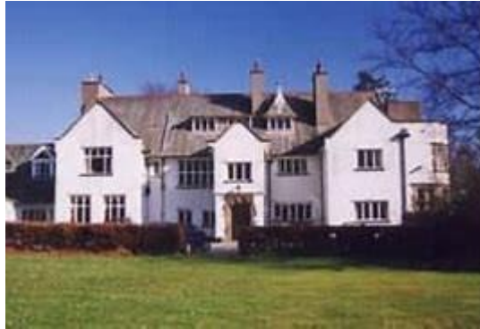
3 - Keppleway