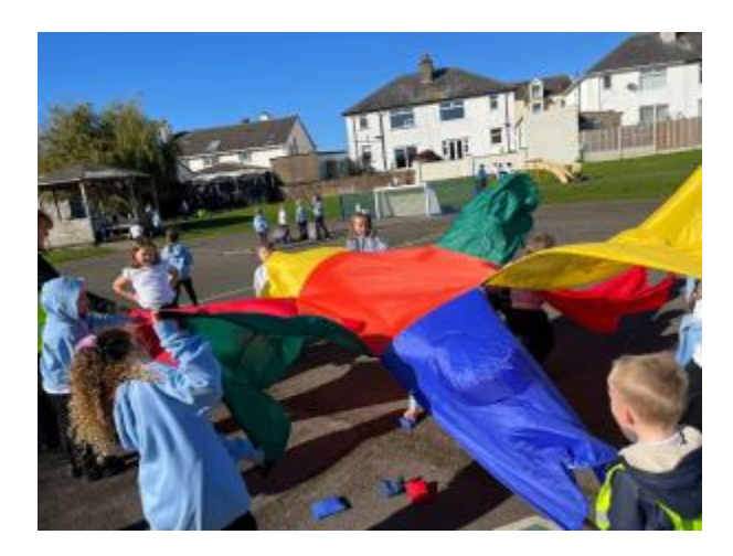
4 - collaborative play