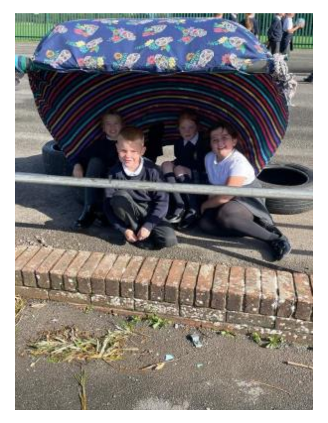
6 - den building