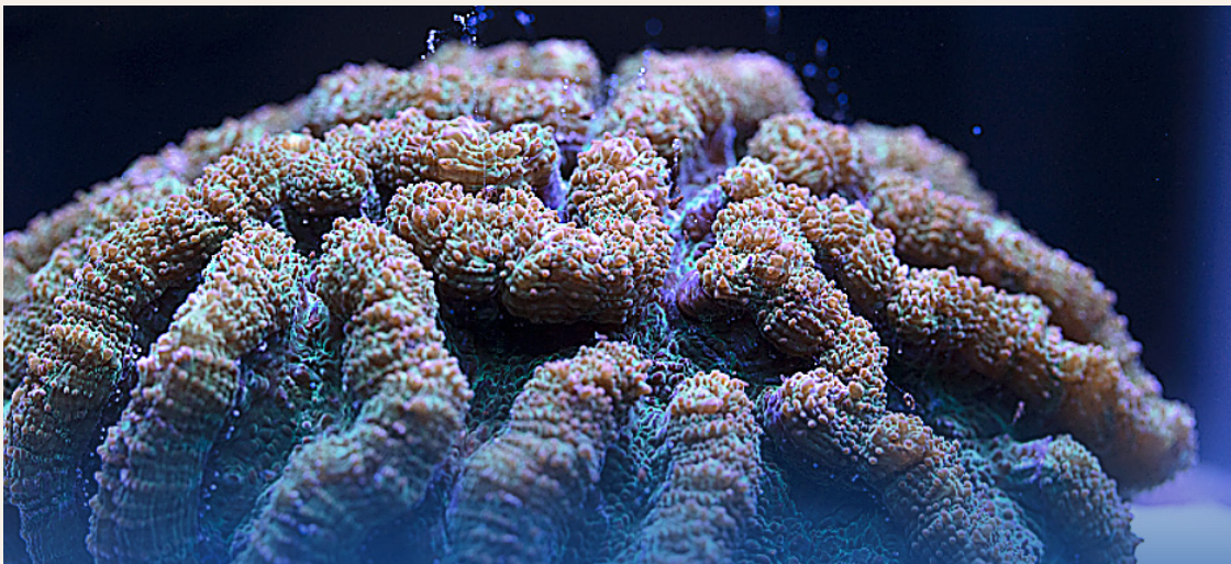
A ridged cactus coral (left) and its larvae (below)