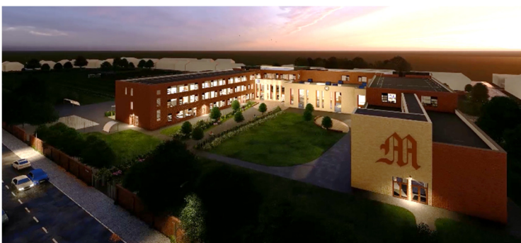
Below: 3D image of the new School building