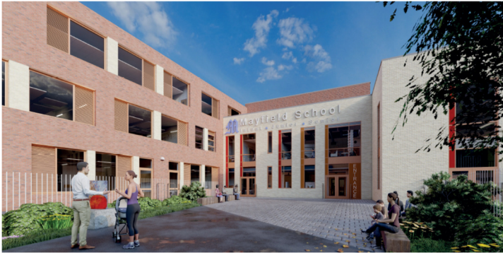
Above: 3D image of the new School Entrance

Kier are very excited to begin works on the new building for Mayfield School. The new build will be situated to the east of the schools' current site. The school will stay operational in their current building and will move to the new school in July 2021. The final phase of the project will be the demolition of the old building, making way for the schools' extended playing field. Kier is due to complete their works in April 2022.