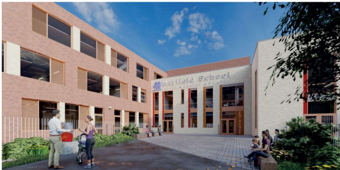
Above: 3D image of the new School Entrance

Kier are very excited to begin works on the new building for Mayfield School. The new build will be situated to the east of the schools' current site. The school will stay operational in their current building and will move to the new school in July 2021. The final phase of the project will be the demolition of the old building, making way for the schools' extended playing field. Kier are due to complete their works in April 2022.