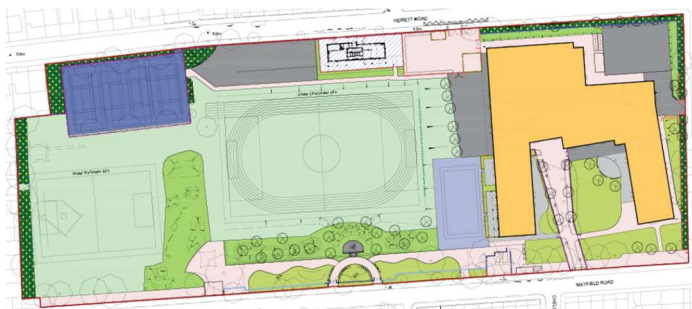
Above: Site MasterPlan of the Scheme