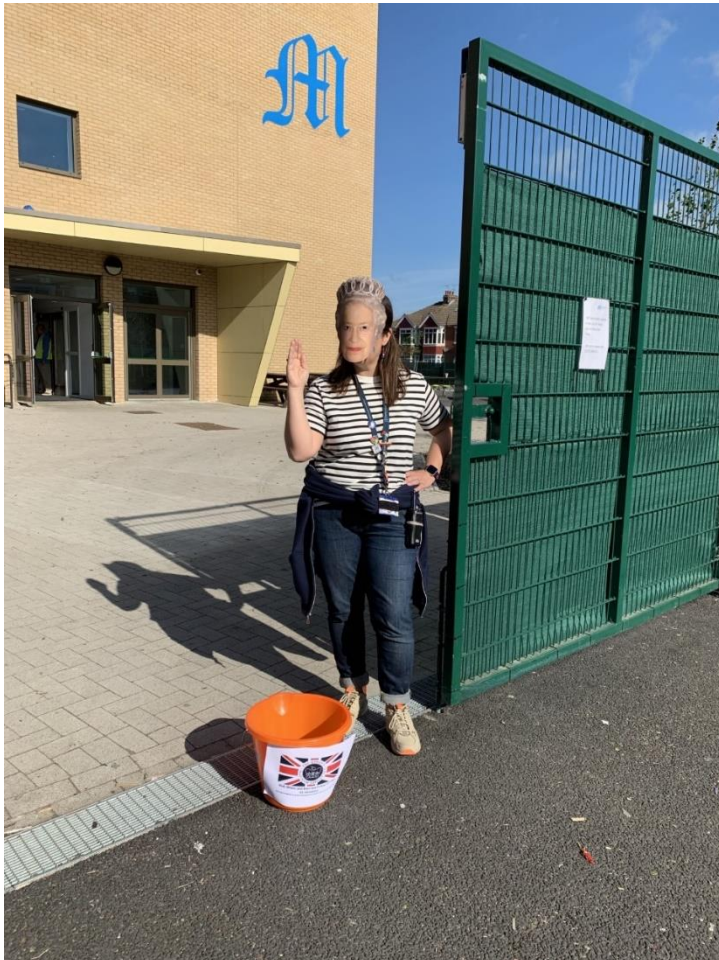
From Miss Franklin:

Thank you to all the senior pupils who supported Red, White and Blue day today! We were honoured to have the queen on the gate collecting donations! If your child forgot their donation, please ask them to hand it in on the gate after the holiday. All monies raised are to be used to develop the outside spaces for the pupils.