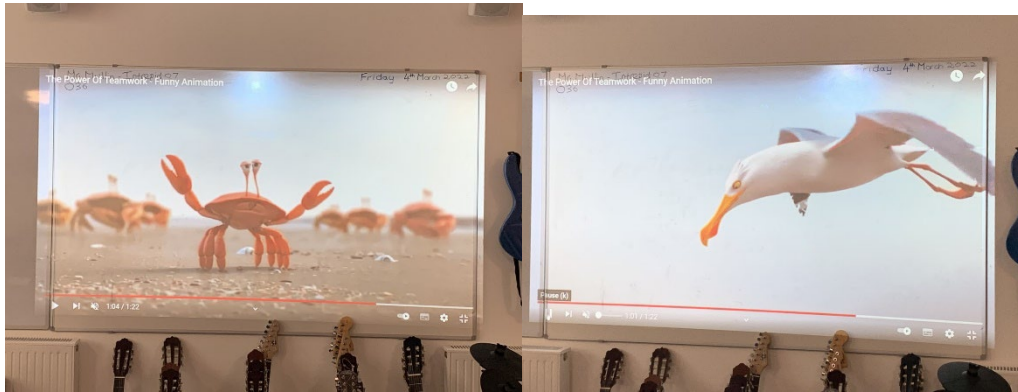
Taster session for BTEC Music- looking at music used in films