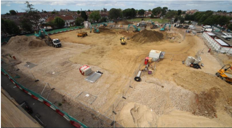
Site Operations Today – 4 July 2022

An update on the project we are delivering for your local community