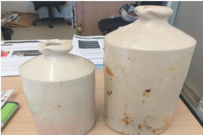
Inkwell Refill Bottles found under the school

The project has achieved 329,969 man hours accident free to date.