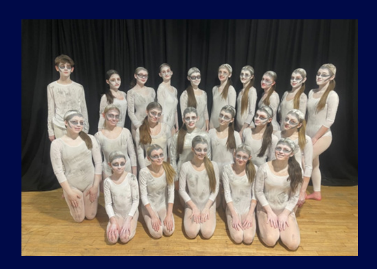
Our 'dead soul' section.