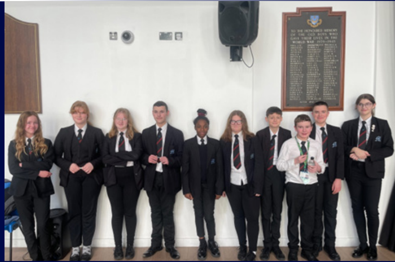
Discovery's 'Ready' badge winners.