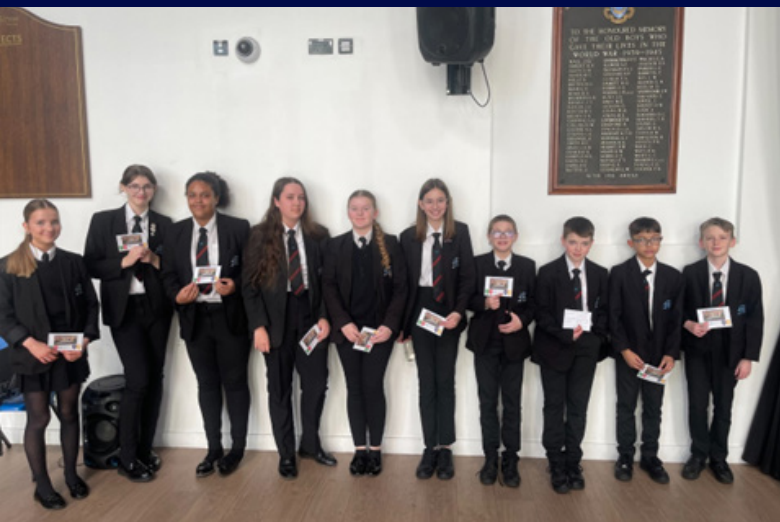
Discovery's PE postcard winners.