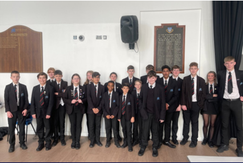
The excellent attendance badge winners so far this year!