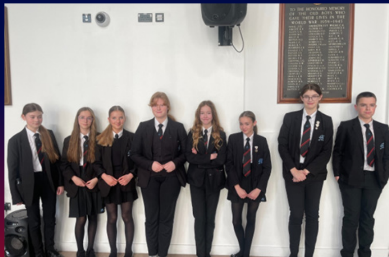
Discovery's 'Respectful' badge winners.

Discovery have had a great start to 2023 with lots of students being recognised for their continued hard work and dedication to learning. It has been so lovely to see so many of our students gaining achievements for both work inside of school as well as through their attendance. Celebrating the students' success has been a highlight of the term with the Mayfield 6Rs continuing to be a focus into the this half term. We aim to have more people in the photos especially after our upcoming Discovery Charity Week Event.