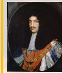
King Charles 11 The king of England at the time of the Great Fire.