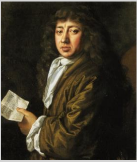
Samuel Pepys 1633 – 1703

Samuel Pepys lived over 300 Years ago, when the Fire of London occurred. He wrote a diary recording all the events of the Great Fire.