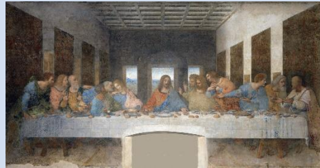
The Last Supper (1490s)