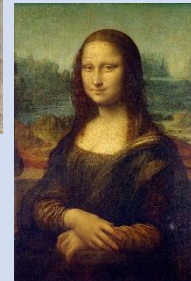
Mona Lisa (1503 – 1506)