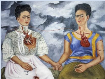
The two Frida's (1939)