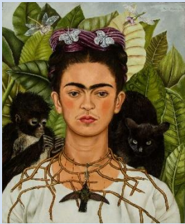
Self portrait with thorn necklace (1940)