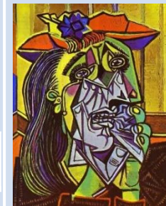
Left: The Weeping Woman (1937)