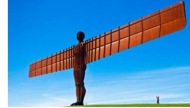
The angel of the north.