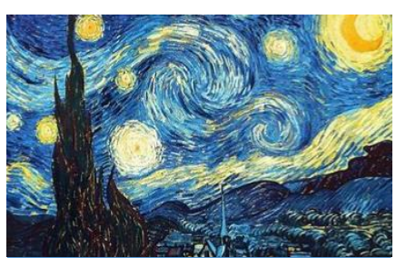
Vincent Van Gogh