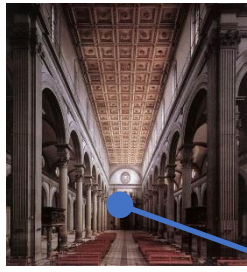
The Nave of the Church 1419