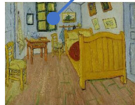
Bedroom in Arles 1888

Renaissance – European art and literature from the 14 th -16 th century (1301-1600) Realism – To represent the subject truthfully Impressionism – To re-create the feeling of a scene