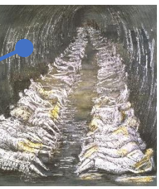
Tube Shelter Perspective 1941

Matchstalk Men and Matchstalk Cats and Dogs