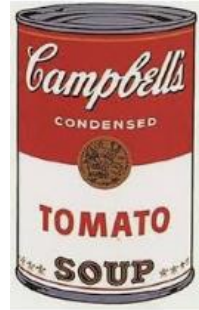
Campbell's Soup 1962

(Born Andrew Warhola; August 6, 1928 – February 22, 1987) Warhol was an American artist, director, and producer who was a leading figure in the visual art movement known as pop art.