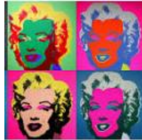
Marilyn Diptych' 1962