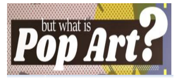
Pop Art art based on modern popular culture and the mass media, especially as a critical or ironic comment on traditional fine art values