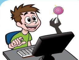
A Parent's Guide to Online Grooming