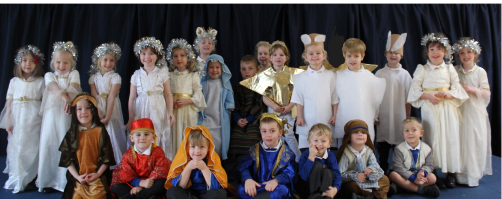
Well done to Reception Class for their wonderful performances of the Nativity. They bravely performed once to the whole school and then to all their parents. We really enjoyed their telling of the Sleepy Shepherd and the efforts they made to wake him up! Thank you, Class R.

School Opens to Pupils Wednesday 3rd January