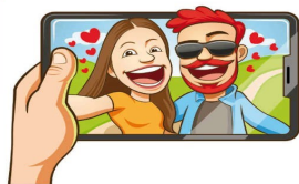
A Parent's Guide to Sharing Pictures